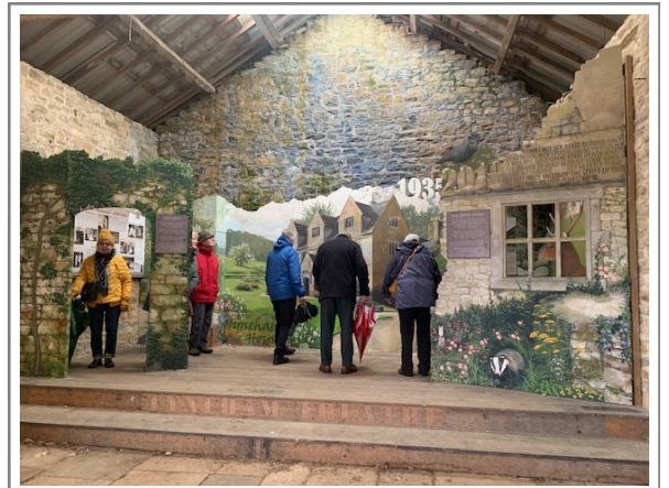
Exploring the theatre (and sheltering from the wind and rain!)

A wonderful place to take the younger members of your family when they visit. Jenny Whitley.